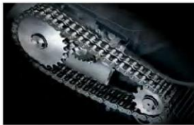
SUPER POTENTIAL POWER SYSTEM

Heavy duty chain drive with steel gears which offer reliability and resistance to wear.