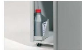
AUTOMATIC OILING SYSTEM

The Automatic Oiler eliminates the need to manually lubricate the unit. Not only does this protect the blades with anti-corrosive agents, but ensures maximum reliability, efficiency and capacity.