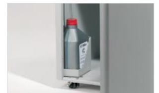
AUTOMATIC OILING SYSTEM