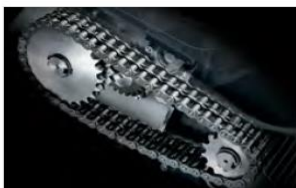
SUPER POTENTIAL POWER SYSTEM