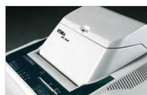
LOCKABLE COVER (LK)