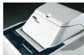
LOCKABLE COVER (LK)

It can shred automatically 170 sheets, whilst the operator can shred paper in the main throat and CDs/DVDs/Credit cards through the dedicated cutting unit, at the same time.